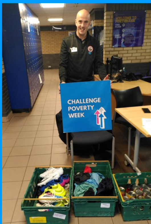
(Left) Stirling Albion FC host a kit recycling event at a weekend game during Challenge Poverty Week 2023

Pre-owned clothing gifted to Big Hearts' participants.