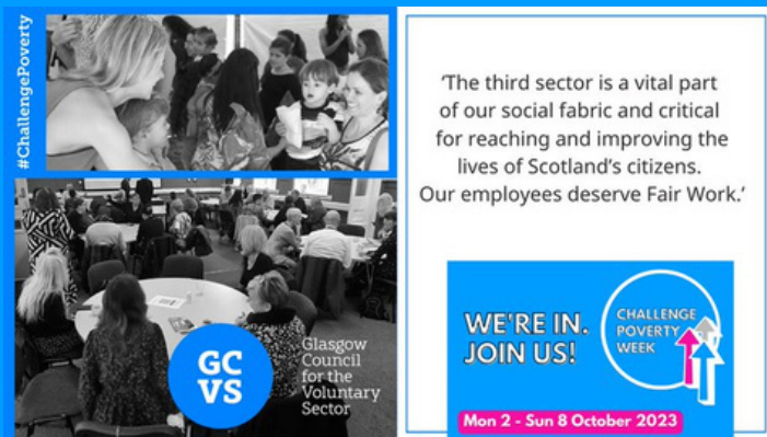
GCVS highlight key messages during CPW23

And make sure you get noticed and use our # on your social media!