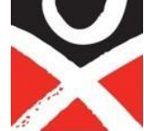
Figure 1: National Improvement Framework Key Drivers of Improvement